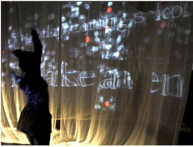
Figure 3. Image of a dancer with word-features projected into the environment.