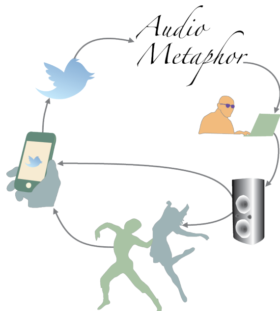
Figure 2. Figure depicting the different actors and their interactions for In[a]moment. A person in the audience sends Tweets to Audio Metaphor. Audio Metaphor then provides the musician with audio file recommendations for soundscape composition. The dancers respond to the soundscape audio. The audience might then Tweet their experience response back to Audio Metaphor.

In[a]moment is a interactive performance piece [22] created under the eight-month Interactive Arts and Technology Capstone course at Simon Fraser University (SFU), School for Interactive Arts and Technology (SIAT). The project took place from September 2011 to April 2012, with its debut showcase on April 2nd, 2012 in the performance and technology show PIT 2012 [23] at SFU Woodward's